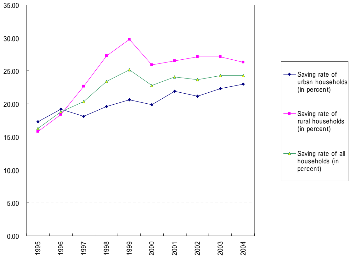
Figure 2: Household Saving Rate in China, 1995-2004

Source: Authors' calculations based on China Statistics Yearbook, 1996-2005 editions